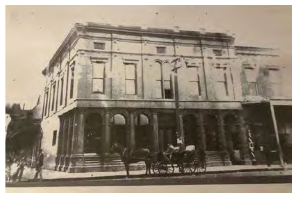
Woodland Bank, after the removal of the top floor.