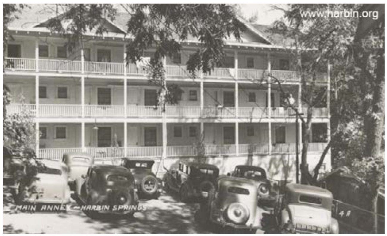
Harbin Hot Springs Main Annex, circa 1938