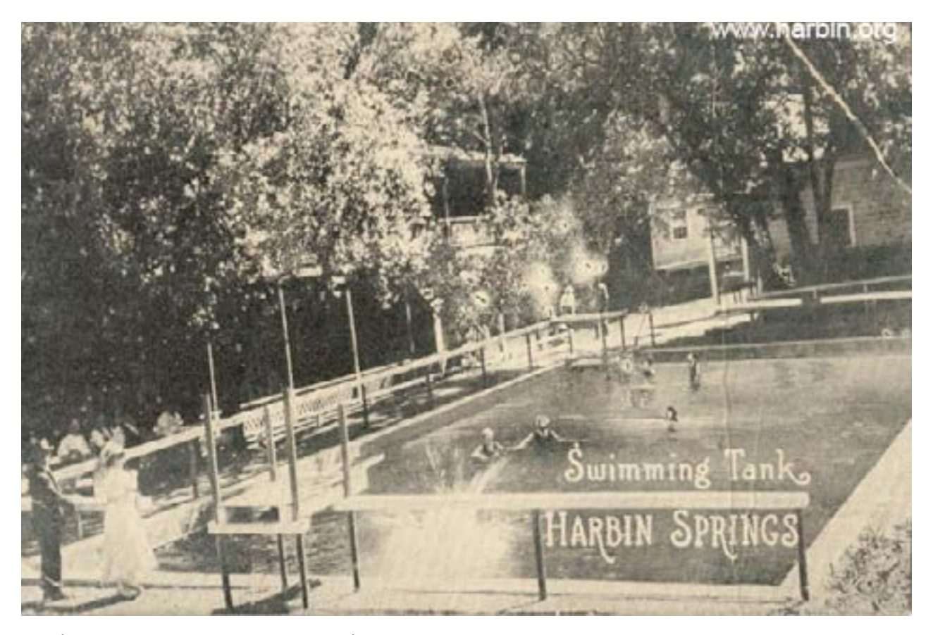
Harbin Hot Springs Swimming Tank, circa 1915

Harbin Hot Springs has been a Victorian resort, a hunting lodge, a boxing camp, and a free-form university and experimental drug haven for hippies. It is now owned by the Heart Consciousness Church , a nonprofit religious organization that runs the springs as a retreat center.