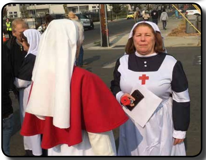
Enthusiasts Arrived in Authentic Nurse Garb