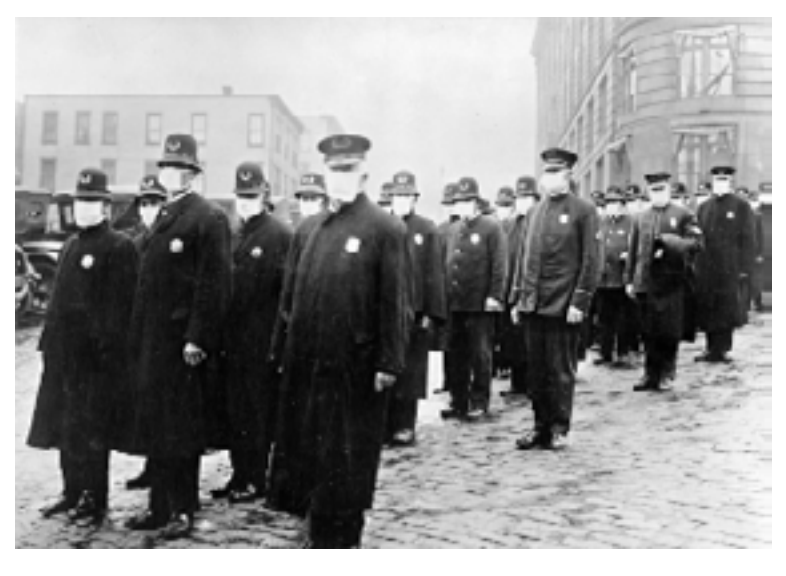
Policemen in Seattle wearing masks made by the Red Cross.

It is estimated that about 500 million people or one-third of the world's population became infected with this virus. The number of deaths was estimated to be at least 50 million worldwide with about 675,000 occurring in the United States. Mortality was high in people younger than 5 years old, 20-40 years old, and 65 years and older. The high mortality in healthy people, including