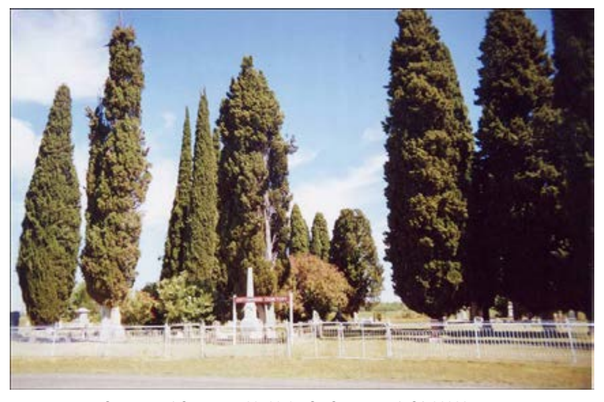
Cottonwood Cemetery, 20499 1st St, Cottonwood, CA 96022

Go on a walk-a-bout. Learn some history. Have fun.